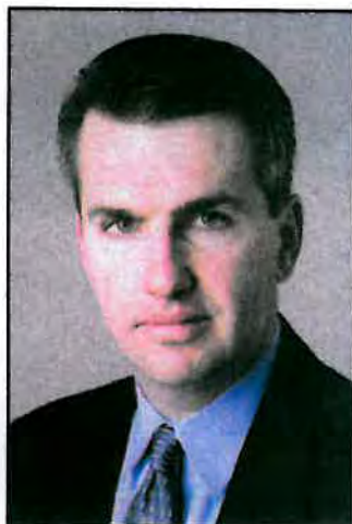
Gregory Garrabrants CEO Bank of Internet USA Page 8